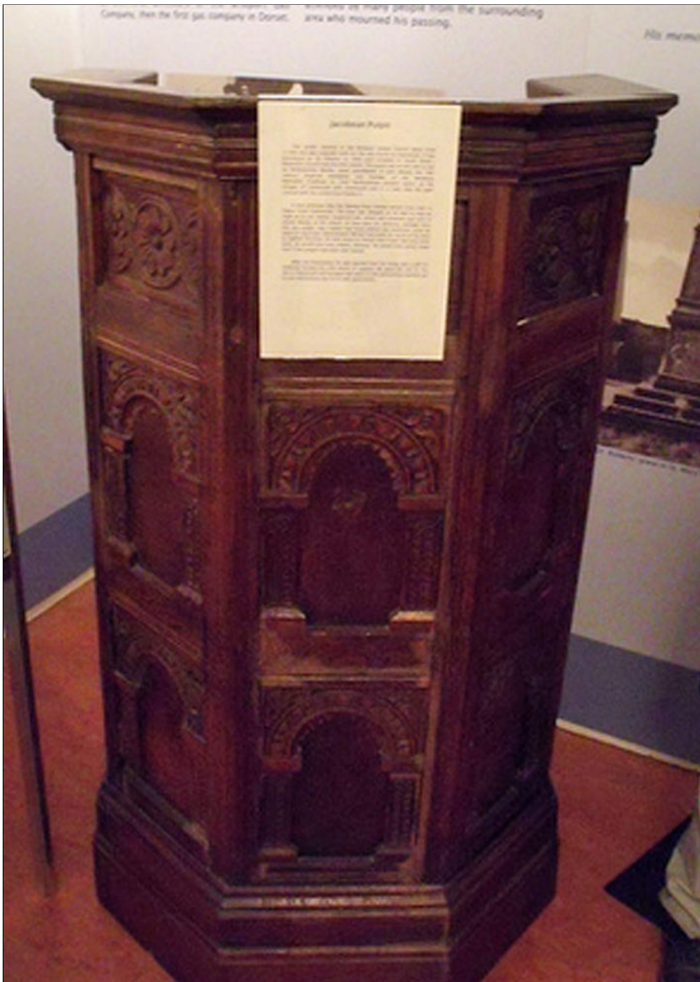
The Pulpit was in the Wesleyan Chapel, Bridport, but now in the Museum —of oak, octagonal with moulded rails and styles and three ranges of panels, the two lower with enriched arches and the top panels with rosettes etc., early 17th-century