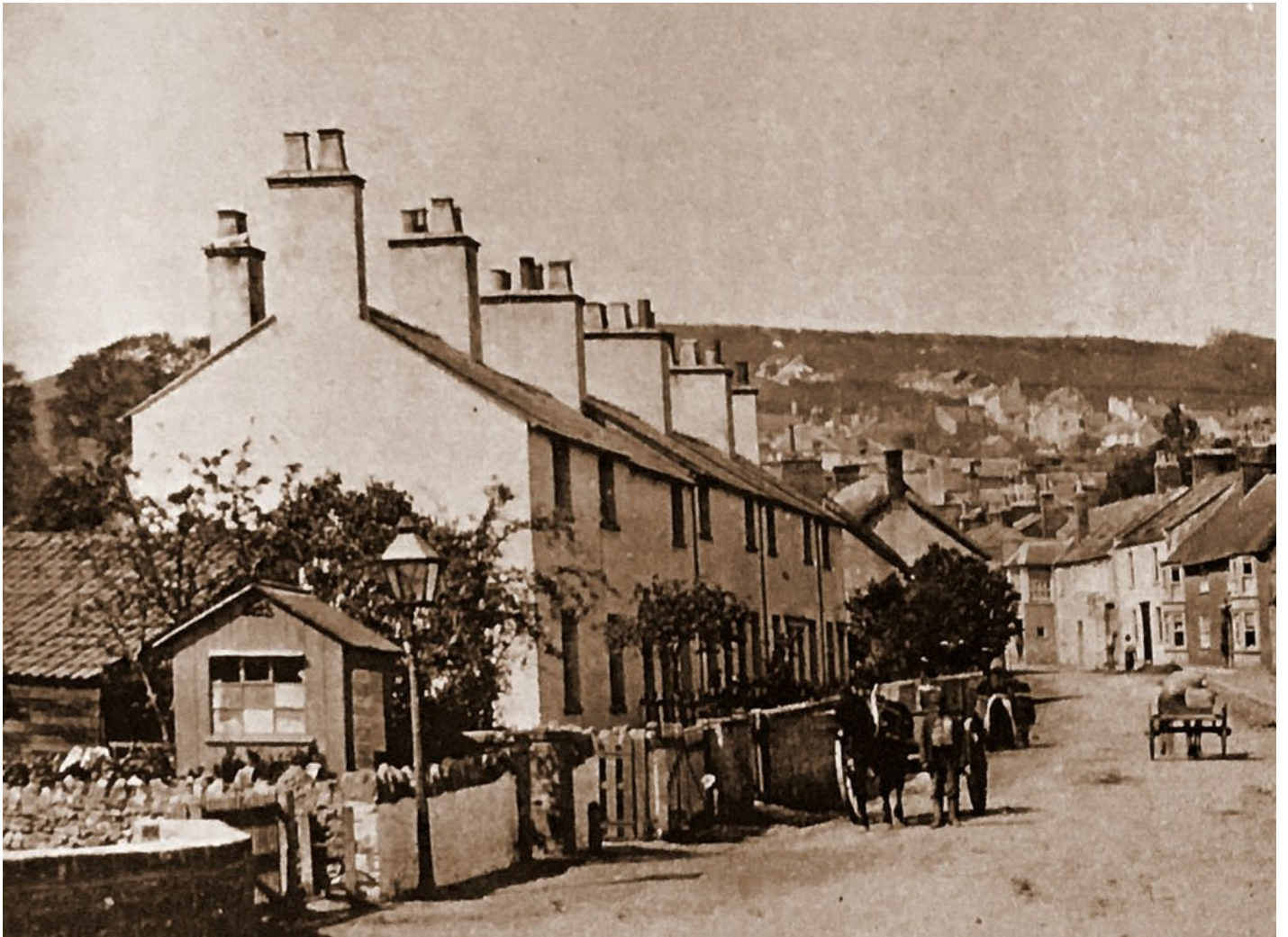
The cottages on the left of this photo that replaced the original house where Benjamin Wesley lived, which was destroyed by a fire in 1851